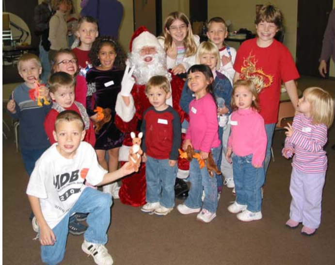
Some of the participants at CSAM's cueing Santa event.